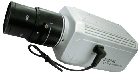
• FRONT VIEW