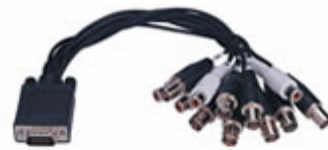
1-8 Cams Video/Audio Cable