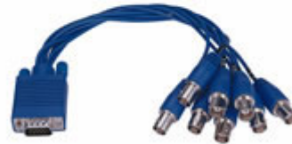
9-16 Cams Video Cable