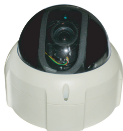
• Top View